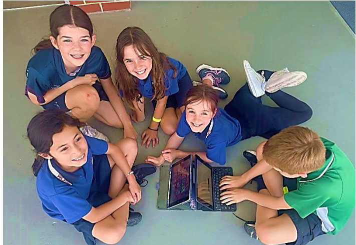
Image: Students at the BYOD Session held on 30 October

We have a full newsletter for you this week, full of achievements and celebrations happening not just within the classrooms, but also outside the school. We love sharing these successes and seeing what our students get up to when they're not in school.