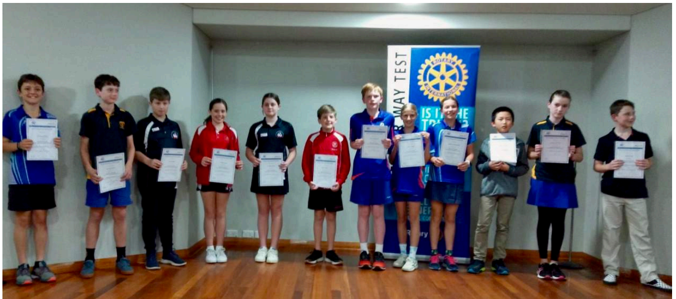
Rotary 4-Way Speaking Competition