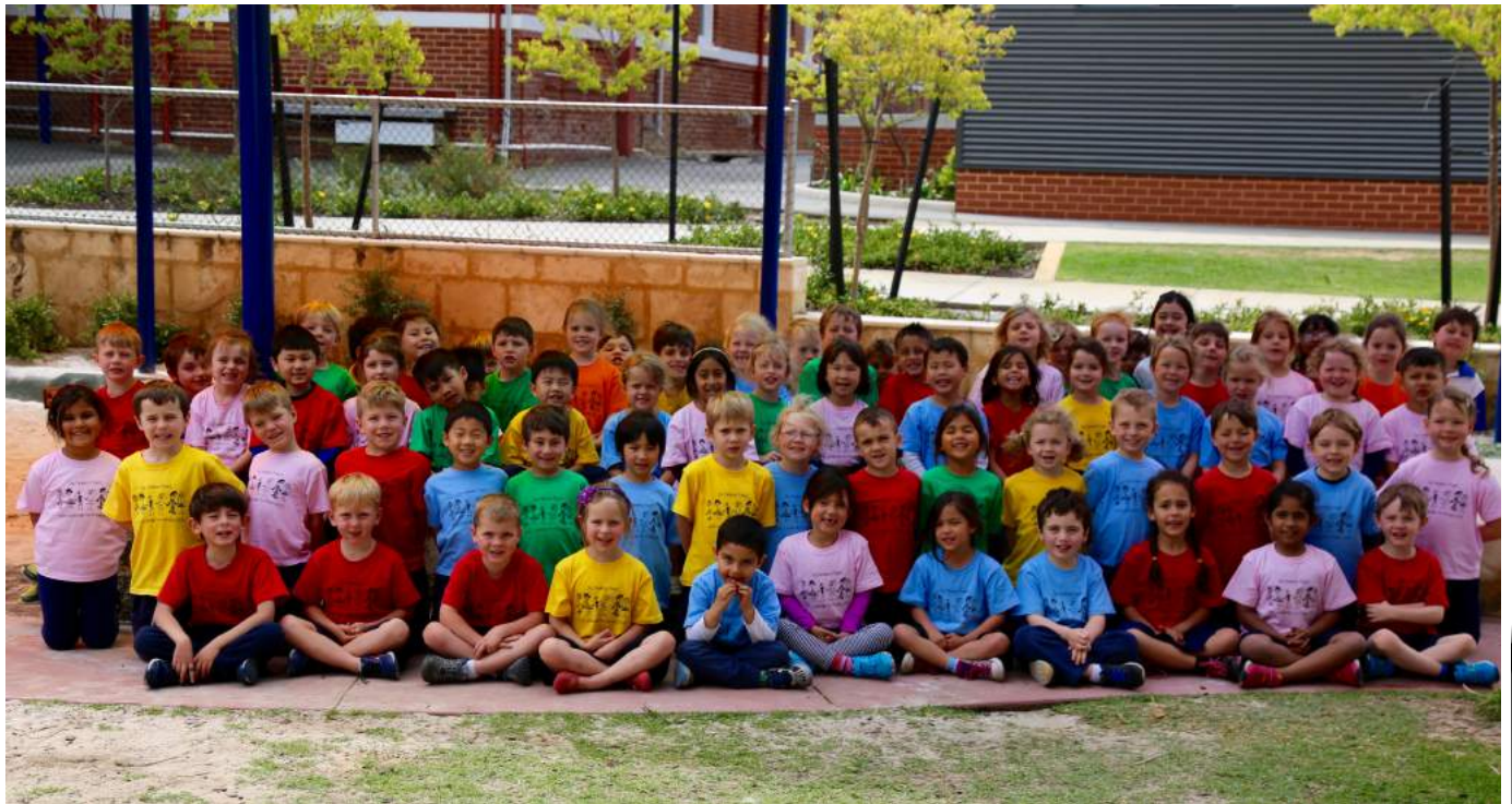
Pictured above, the students from the WLPS pre-primary classes proudly display their brightly coloured t-shirts promoting the Kindness project.

This week the Pre-primary classes have launched their Kindness Project and are wearing bright coloured t-shirts to promote and encourage kind behaviour in their classrooms. Leading up to World Kindness Day (13th November) the Kindness Project originated in the UK and is promoted to help teachers make their classrooms kinder places to be. Evidence shows that promoting kindness among young people directly reduces bullying and disruptive behaviour and helps to increase social and emotional wellbeing.