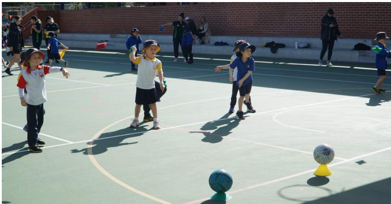
Students are enjoying being taught lots of different netball skills.

During Term 3, our students were fortunate enough to have Year 12 students from the SEDA Netball program come in during their Phys Ed classes to coach them through ball and movement skill sessions. Students enjoyed participating in new drills and mini games where they were given the opportunity to expand their existing skill base. The small SEDA to WLPS student ratio meant that students were able to get lots of undivided attention and assistance throughout the day. There were lots of smiles, hard work and of course, great sportsmanship.