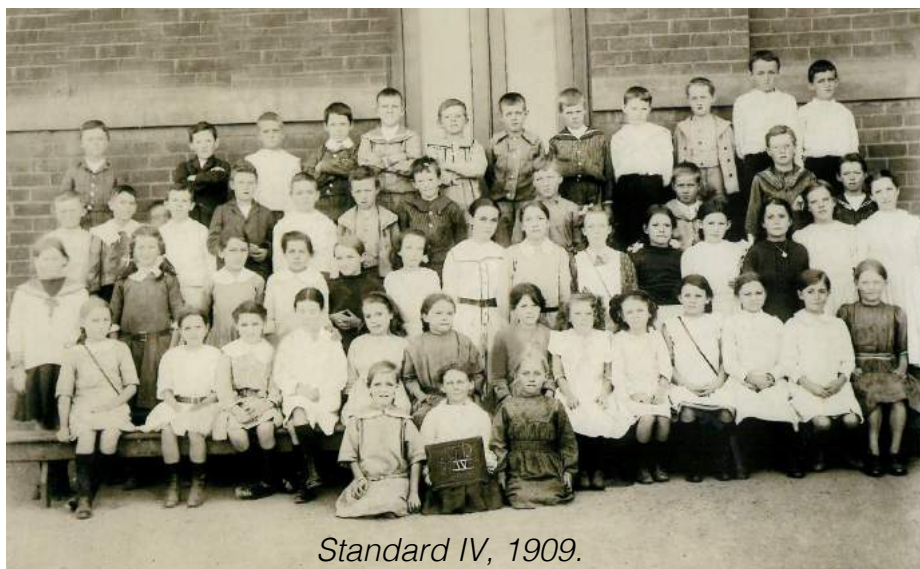
Right: One of the many fabulous photos on display at the 120 Year Anniversary