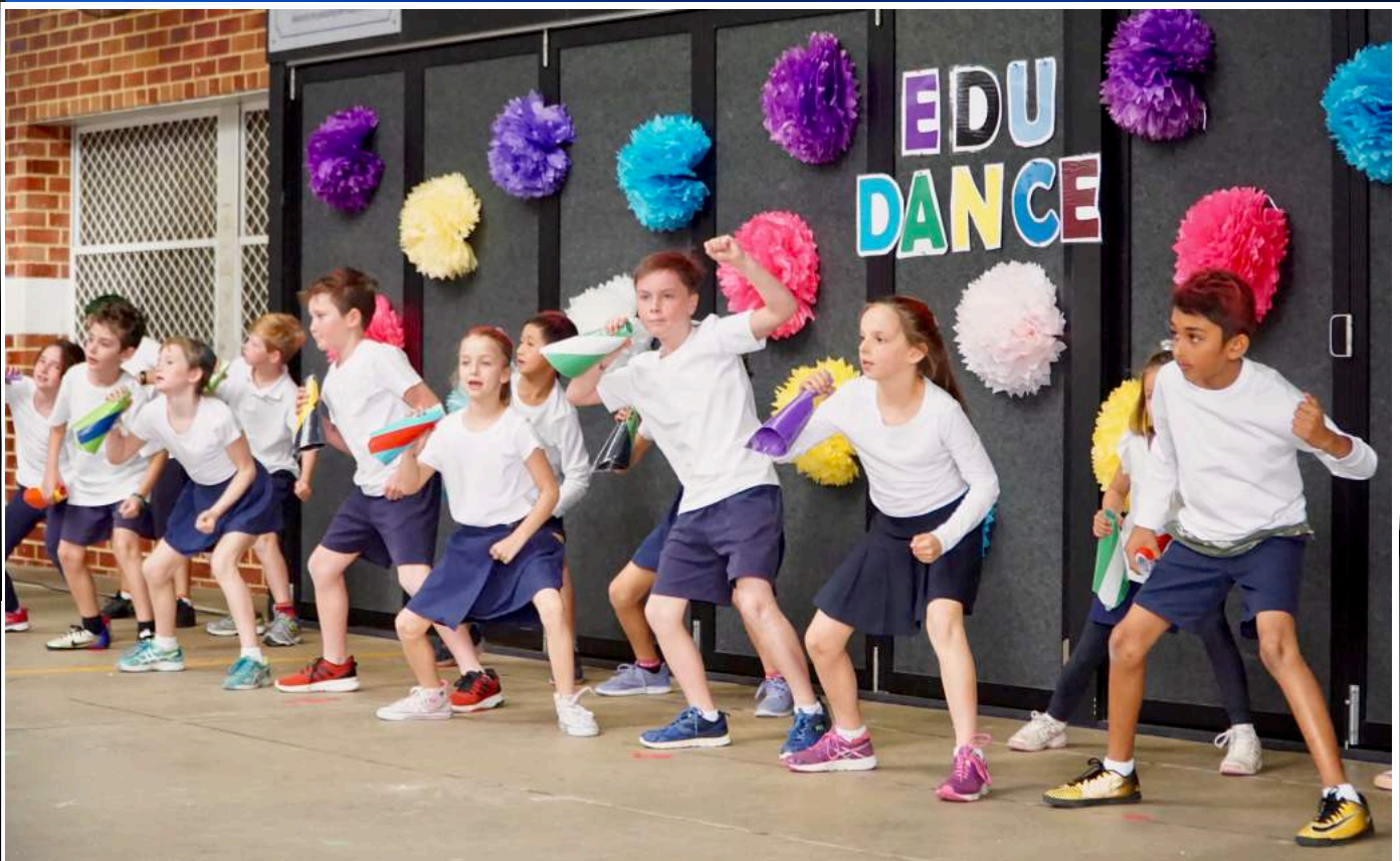
Pictured above, Year 3 Blue

The last week in Term 2 heralds the greatly anticipated Edudance concerts for all of our students. Following a term of weekly dance lessons, each class presents their dance item before their parents, staff and students. The concerts were held on Tuesday and Friday afternoons and as always were performed with great enthusiasm. Not to be outdone, the kindergarten students also held their concerts this week. Thank you for all the families who came along to watch the concerts and encourage the dancers.