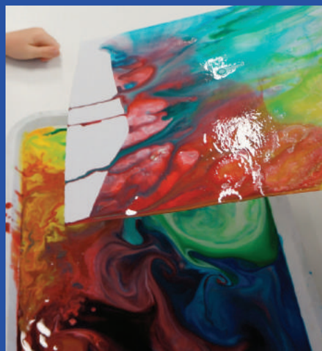
Budding Artists 1 - 4 years