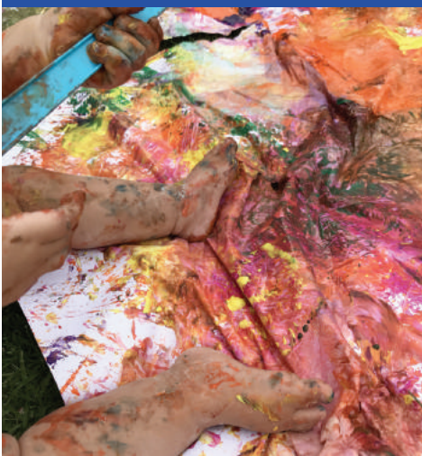
Toddler Sensory 1 - 2 years

Two Early Childhood Teachers who love Art, Science and Play