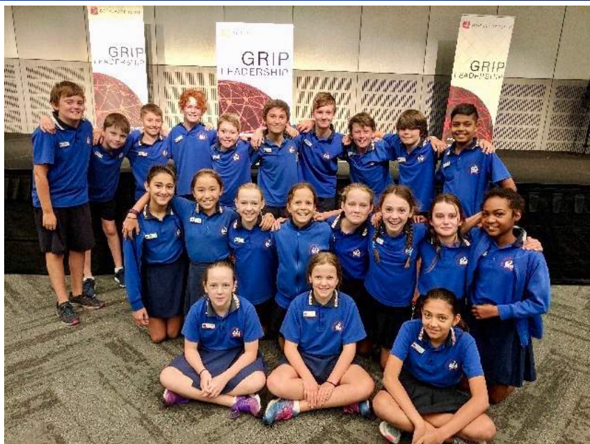
The Year 6 student leadership group at the GRIP conference this week.

There were lots of opportunities throughout the day for our leaders to get to know other leaders and to discuss their ideas.