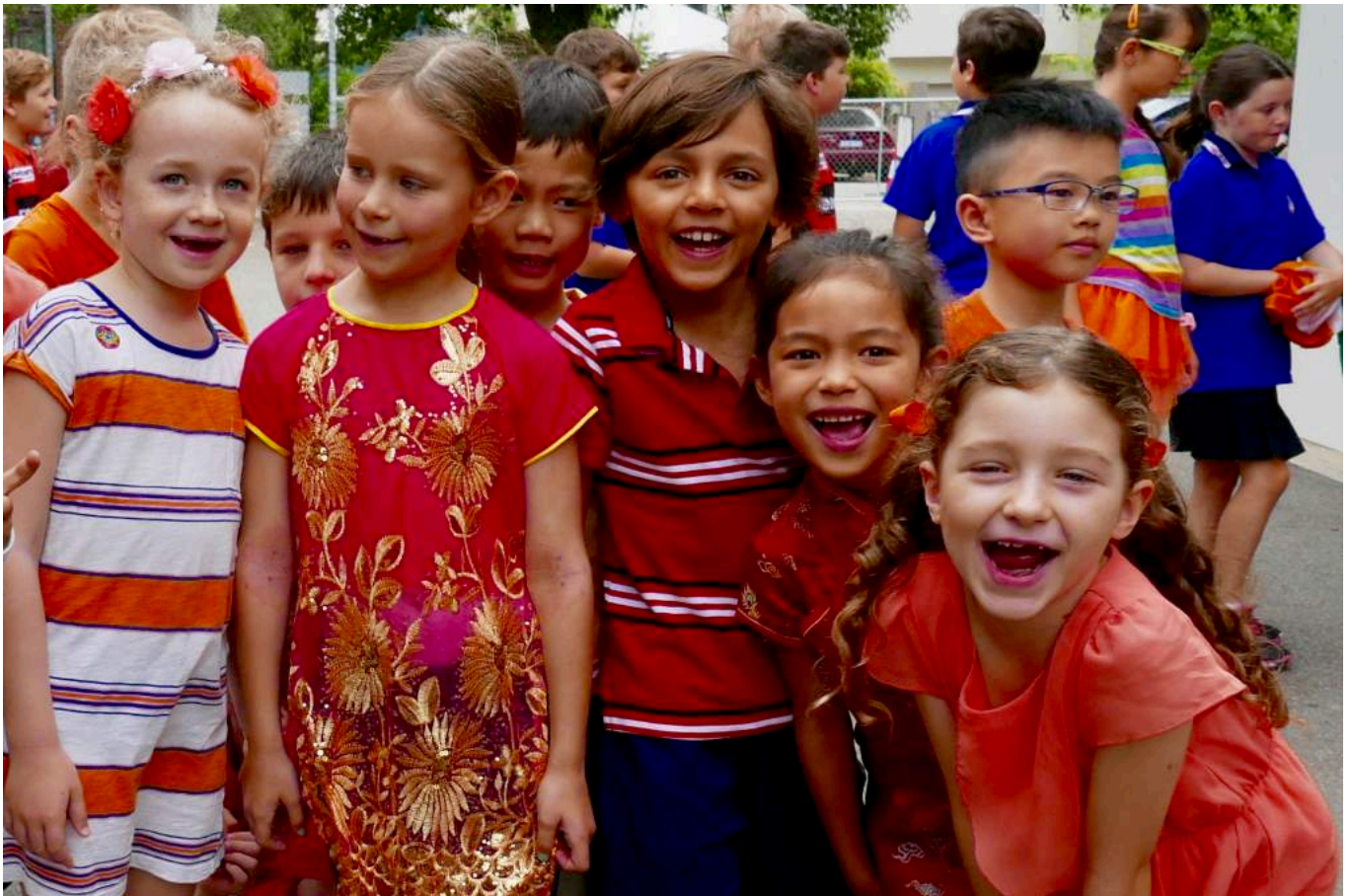
Pictured above, students from Year 2 add to the colourful display of costumes and clothing on Harmony Day

Harmony Day was celebrated at West Leederville Primary School today Thursday, 22nd March and was an occasion to celebrate our cultural diversity as a school and as a nation. The theme for this year's Harmony Day, 'Everyone Belongs', was beautifully exemplified by our special Harmony Day assembly where the whole school came together to showcase different cultures. Students dressed in costumes or outfits to reflect another culture or in the special Harmony Day colour of orange. The undercover area was awash with colour and the atmosphere was one of joy and unity.