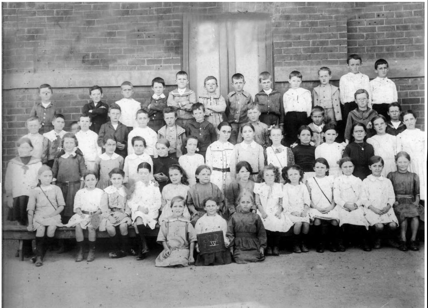
Pictured above, the Standard IV class picture in 1909.

This year, 2018 marks the 120th year since the West Leederville Primary School opened its doors. Back when Western Australia was still a colony; the first motor car had just arrived in Perth; gold was discovered in Kalgoorlie; and, women were yet to be given the vote, a petition for a school to be established in West Leederville was made to the Inspector General of Education. The building was approved and on Tuesday, 1st November, 1898, the school opened its doors for the first time. The original building consisted of what are currently rooms 1, 9 and 10 whilst the IT storage room and the Psych/Chaplain office originally served as hat rooms.