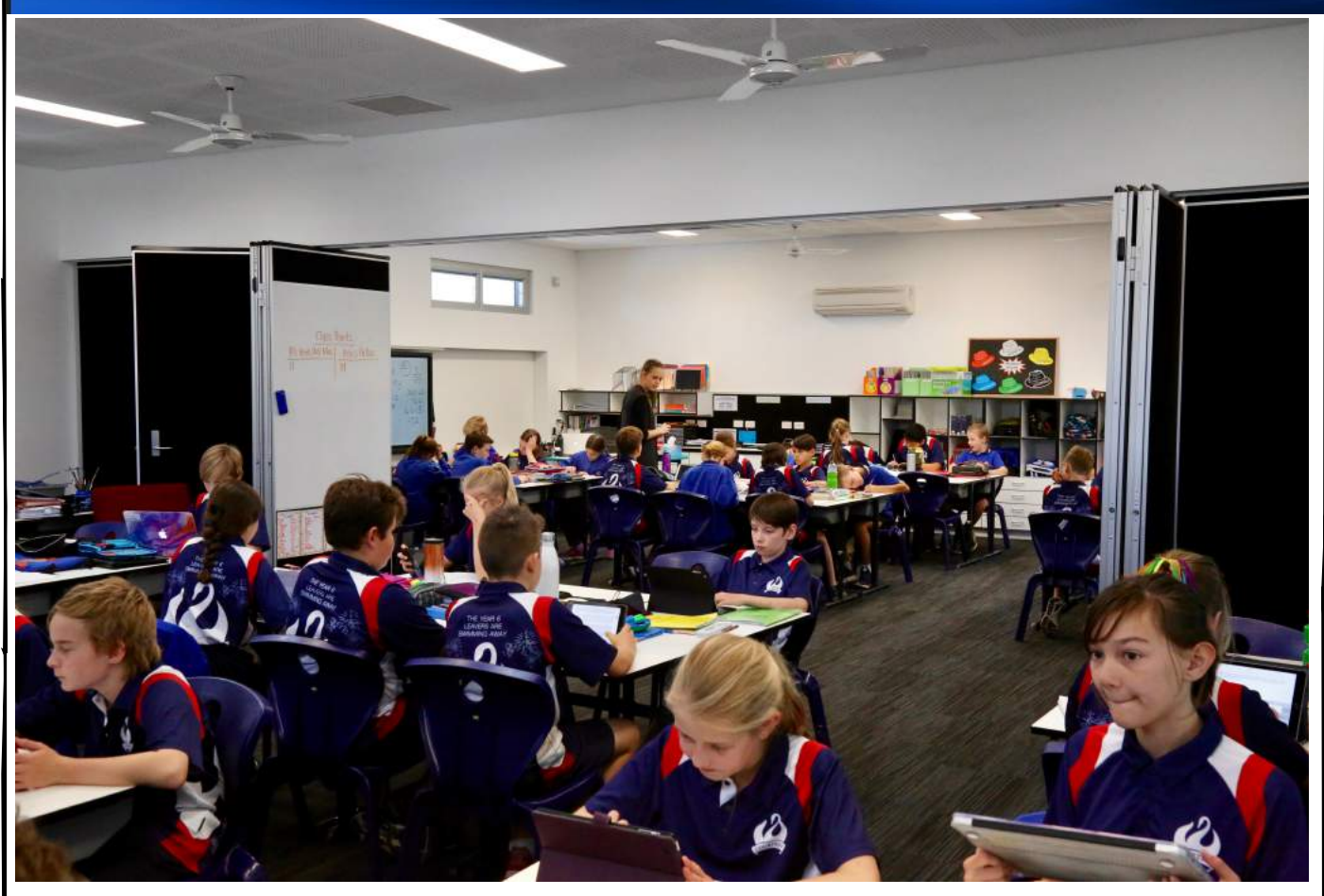
Pictured above, the Year 6 students at work during one of their combined lessons. The rooms have designated backpack storage cubes for each student and individual built in drawers.

With great anticipation, the fences have come down around our library wing, our playground has been reclaimed as have our library, music and art rooms, and our new senior classrooms have been revealed. On the first day of this term the students from years 5 & 6 picked up their trays and walked into their brand new