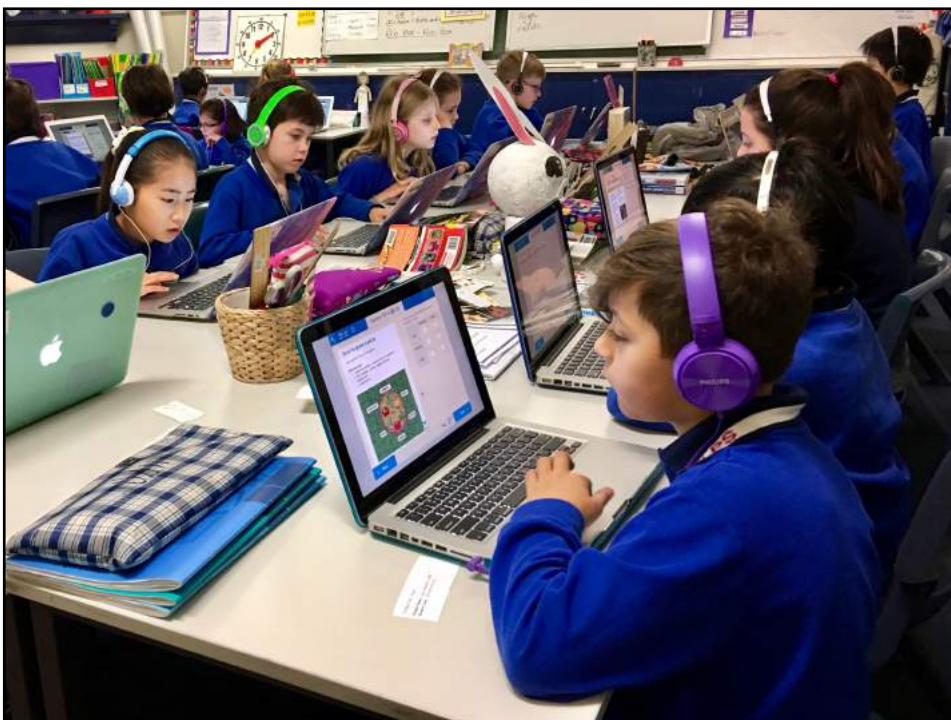
Year 3 students try out the online NAPLAN earlier this week.

West Leederville Primary School opted to be involved in the national NAPLAN Online school readiness testing this year. Approximately 500 schools across the country participated.