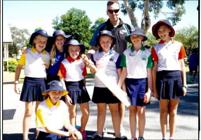
Pictured above are some of the students who participated in the recent Perth Scorchers School Ambassador cricket program.