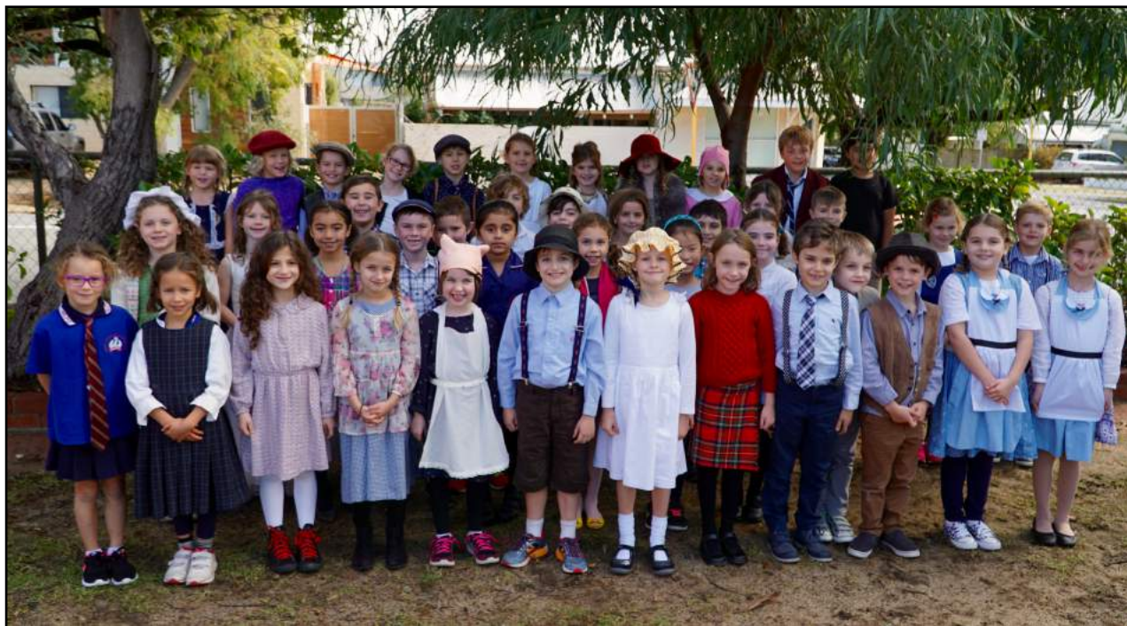
The students from Year 2 dressed as 'WLPS students from the past' for their afternoon tea with their grandparents and special friends.

During our work about 'Past and Present', Year 2 Red and Year 2 Blue investigated their family histories, listened to guest speakers, explored artifacts from the past and enjoyed a historical walking tour of West Leederville.