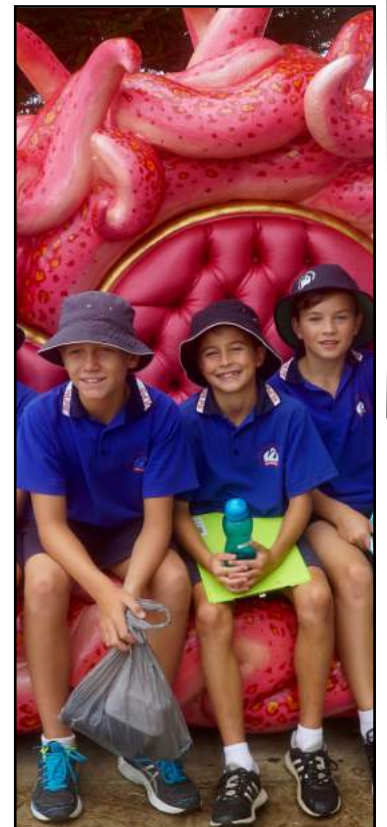
Pictured above, students from Year 6 enjoy the diversity of the sculptures on display.