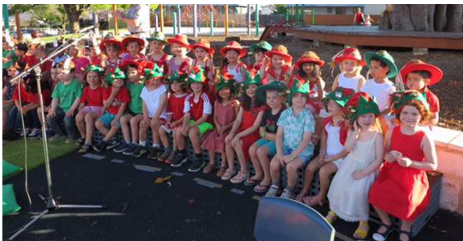
The kindergarten students wearing their Christmas colours as they prepare to sing at the Christmas concert.

The Christmas concert held last evening in our auditorium was a great success. Each class took turns to perform a Christmas carol as their families and other students looked on. The Christmas concert has evolved as an opportunity for families to informally come together and enjoy a small picnic whilst listening to the students sing.